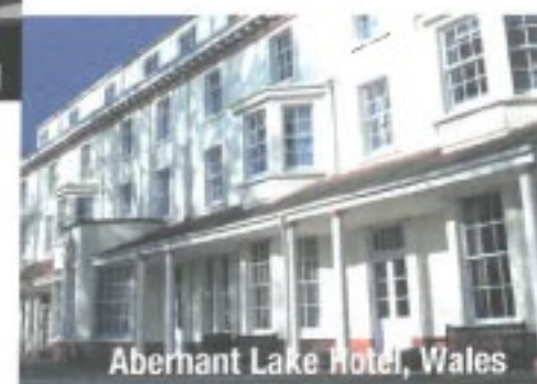
Abernant Lake Hotel, Wales

Your views are very important to us. We would greatly appreciate five minutes of your time to complete and return this form to reception prior to your departure