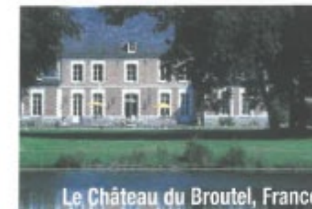
Le Château du Broutel, France

Le Château de Warsy & Le Château du Broutel