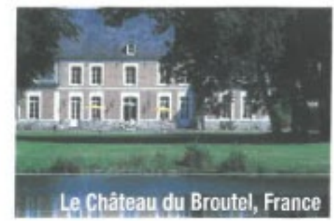
Le Château du Broutel, France

Le Château de Warsy & Le Château du Broutel