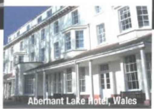
Abernant Lake Hotel, Wales