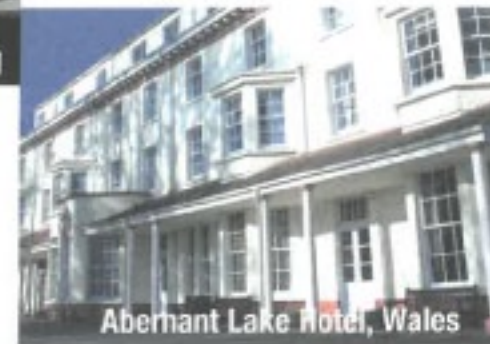
Abernant Lake Hotel, Wales

Your views are very important to us. We would greatly appreciate five minutes of your time to complete and return this form to reception prior to your departure