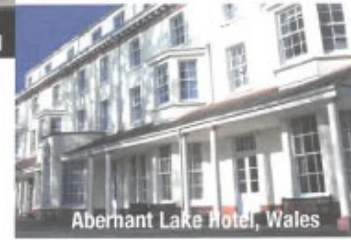
Abernant Lake Hotel, Wales

Your views are very important to us. We would greatly appreciate five minutes of your time to complete and return this form to reception prior to your departure