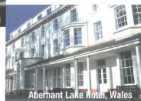
Abernant Lake Hotel, Wales

Your views are very important to us. We would greatly appreciate five minutes of your time to complete and return this form to reception prior to your departure