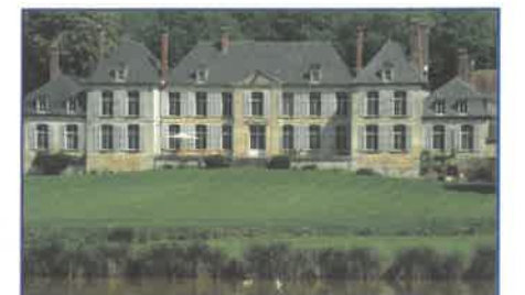
Le Château de Warsy