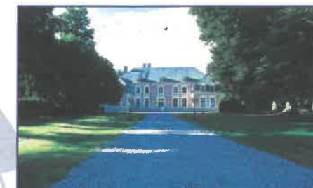
Le Château du Broutel