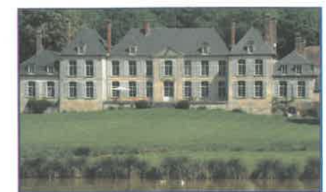
Le Château de Warsy