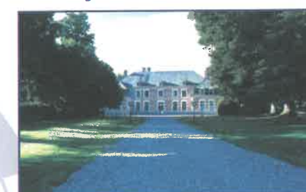
Le Château du Broutel