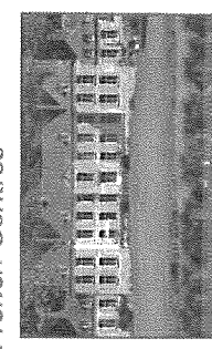
Le Château de Warsy