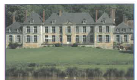
Le Château de Warsy