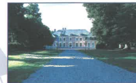
Le Château du Broutel