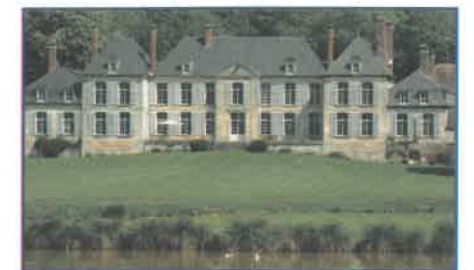
Le Château de Warsy