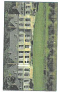
Le Château du Broutel