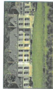
Le Château du Brouet