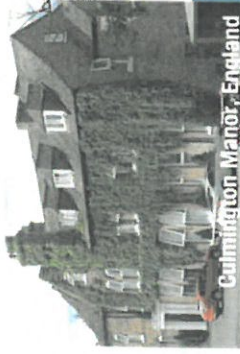
Culmination Manor, England