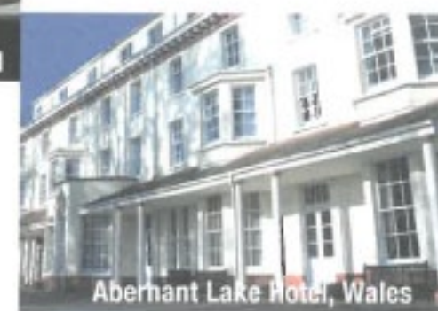
Abernant Lake Hotel, Wales

Your views are very important to us. We would greatly appreciate five minutes of your time to complete and return this form to reception prior to your departure