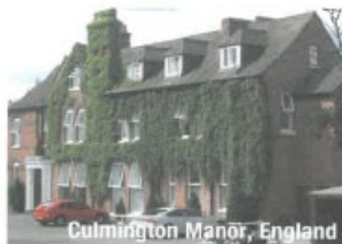
Culmington Manor, England