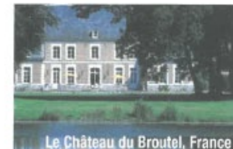
Le Château du Broutel, France

Le Château de Warsy & Le Château du Broutel