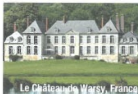
Le Château de Warsy, France

We hope you have enjoyed your visit with us