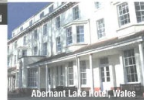
Abernant Lake Hotel, Wales

Your views are very important to us. We would greatly appreciate five minutes of your time to complete and return this form to reception prior to your departure