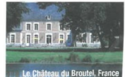
Le Château du Broutel, France

Le Château de Warsy & Le Château du Broutel