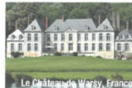
Le Château de Warsy, France

We hope you have enjoyed your visit with us