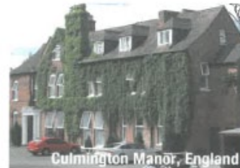
Culmington Manor, England