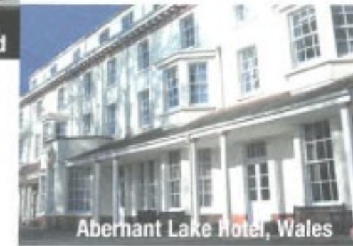
Abernant Lake Hotel, Wales

Your views are very important to us. We would greatly appreciate five minutes of your time to complete and return this form to reception prior to your departure