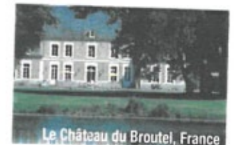
Le Château du Broutel, France

Le Château de Warsy & Le Château du Broutel