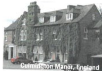
Culmington Manor, England