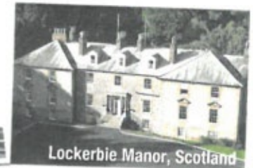
Lockerbie Manor, Scotland

Your views are very important to us. We would greatly appreciate five minutes of your time to complete and return this form to reception prior to your departure