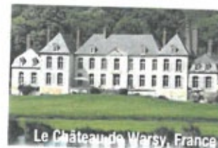
Le Château de Warsy, France

We hope you have enjoyed your visit with us