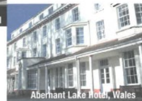
Abernant Lake Hotel, Wales

Your views are very important to us. We would greatly appreciate five minutes of your time to complete and return this form to reception prior to your departure