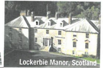
Lockerbie Manor, Scotland